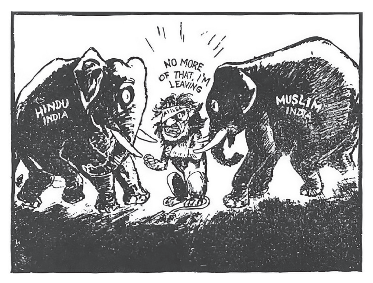
A cartoon from an Indian newspaper about the future of the subcontinent, published in July 1947. Attlee was the British Prime Minister between 1945 and 1951.

Permission to reproduce items where third-party owned material protected by copyright is included has been sought and cleared where possible. Every reasonable effort has been made by the publisher (UCLES) to trace copyright holders, but if any items requiring clearance have unwittingly been included, the publisher will be pleased to make amends at the earliest possible opportunity.