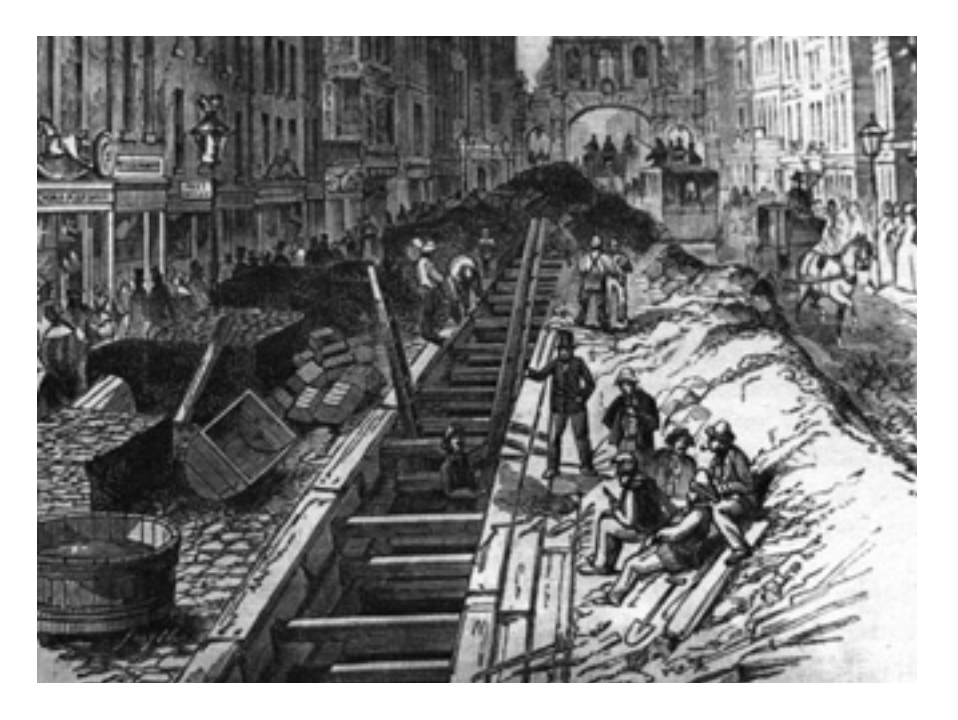
The construction of sewers in London, 1844.